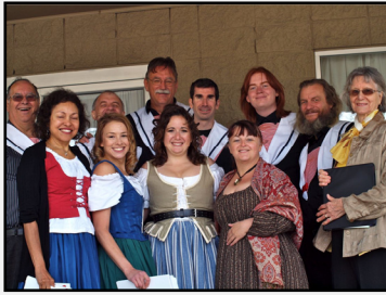
Morpheus G&S Singers at Parkdale's Extraordinary Day

Give the gift of LIVE THEATRE – Gift Certificates make great stocking stuffers!